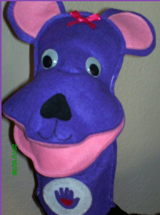
Purple Hands Bear Puppet

The book that we use to explain use of kind words is Excuse Me! By Karen Katz